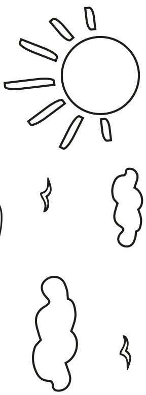
Connect the dots to finish the drawing.